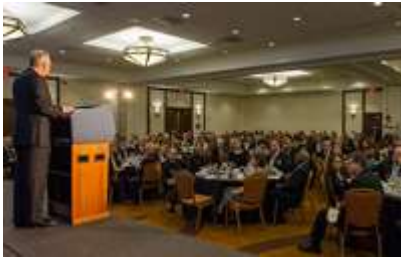
San Antonio State Deputies Meeting

Knights of Columbus councils have always responded to the most urgent needs of the Church, particularly through charitable and social outreach. In order to support the evangelization of family life today, our councils must be even more fully integrated into our parishes. As the world’s largest Catholic fraternal and family organization, we have a responsibility to dedicate our time, talent and resources to ensuring that our parishes are our beacons of the new evangelization.