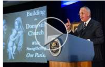
Supreme Knight Mid-Year Meeting Speech